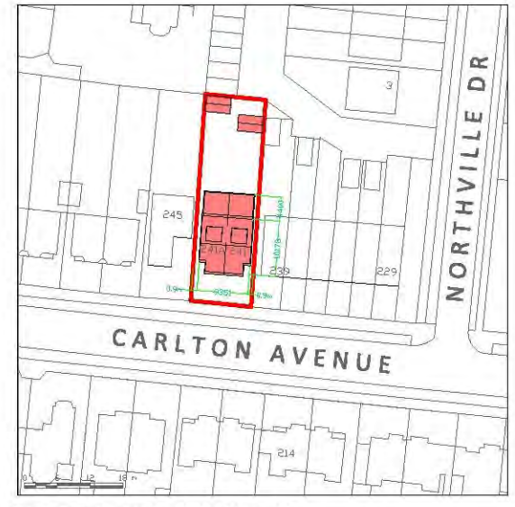
PROPOSED SITE LOCATION PLAN SCALE 1:250